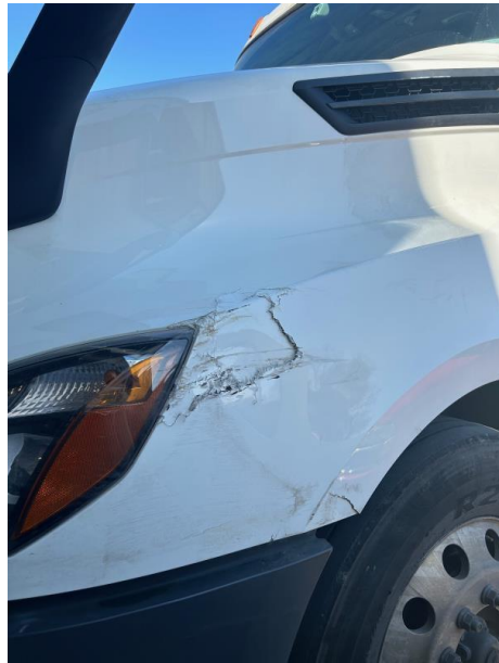
JB HUNT-TRUCK # 358672-3.jpg