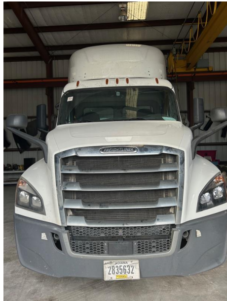
JB HUNT-TRUCK 358672-1.jpg