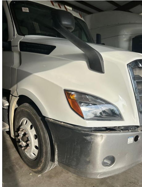
JB HUNT-TRUCK#357629-COMPLETE 2.jpg