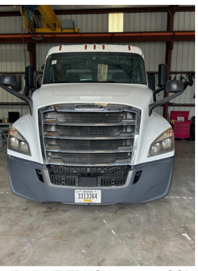
JB HUNT-TRUCK#358038-COMPLETE 1.jpg