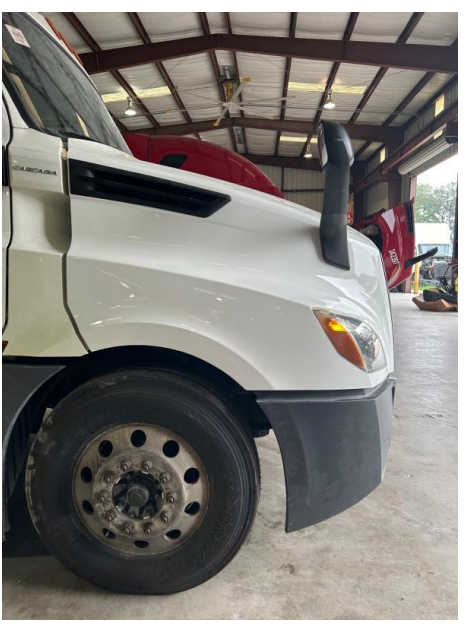
JB HUNT-TRUCK#358038-COMPLETE 5.jpg