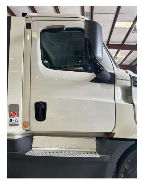
JB HUNT-TRUCK#358038-COMPLETE 3.jpg