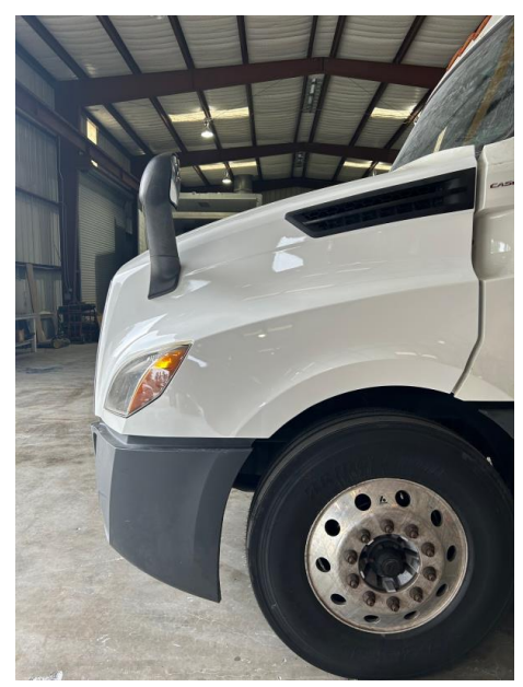
JB HUNT-TRUCK#358038-COMPLETE 4.jpg