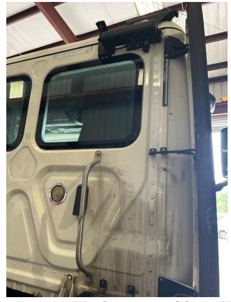
JB HUNT-TRUCK#358038-COMPLETE 2.jpg